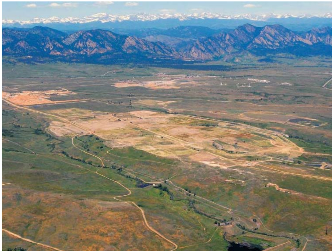
Aerial view of Rocky Flats, 2007