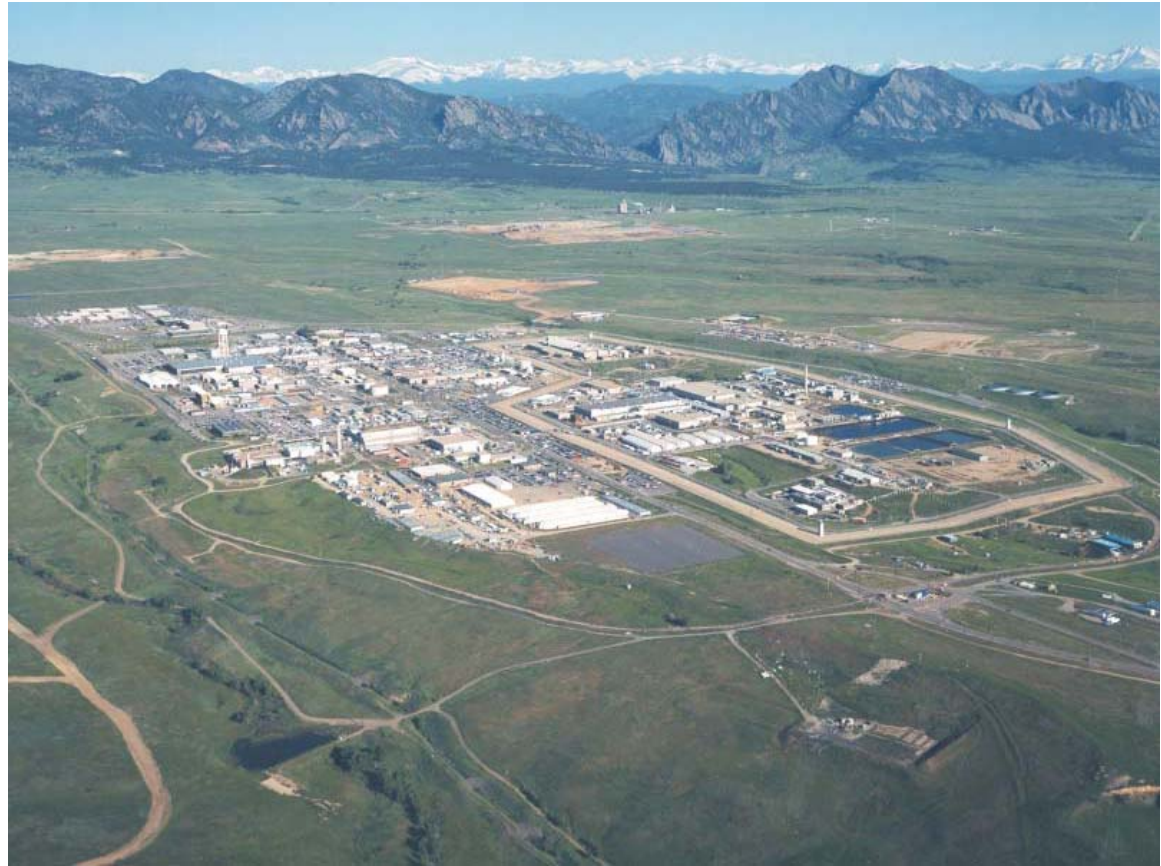
Rocky Flats, aerial view, 1995