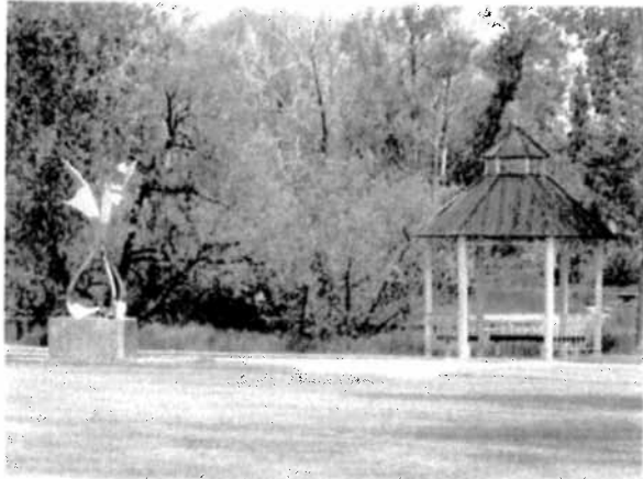
Figure 1: Winburn Park Gazebo and Ascension sculpture

practices. This park is home to “Ascension,” a sculpture gifted to the City by the Northglenn Arts and Humanities Foundation. In 1987, the park was named in honor of former Mayor Charles C. Winburn.