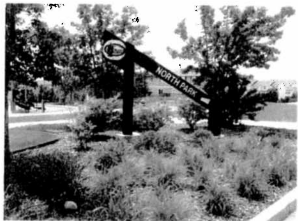
Figure 2: Fox Run North Park sign and tower bed with playground in background

These three, two acre, parks located throughout the Fox Run Subdivision were established in 2000. Each of the parks primarily serves the surrounding neighborhood, and includes a children’s playground, picnic tables, benches and basketball courts. These three playgrounds are scheduled for renovation in 2013.