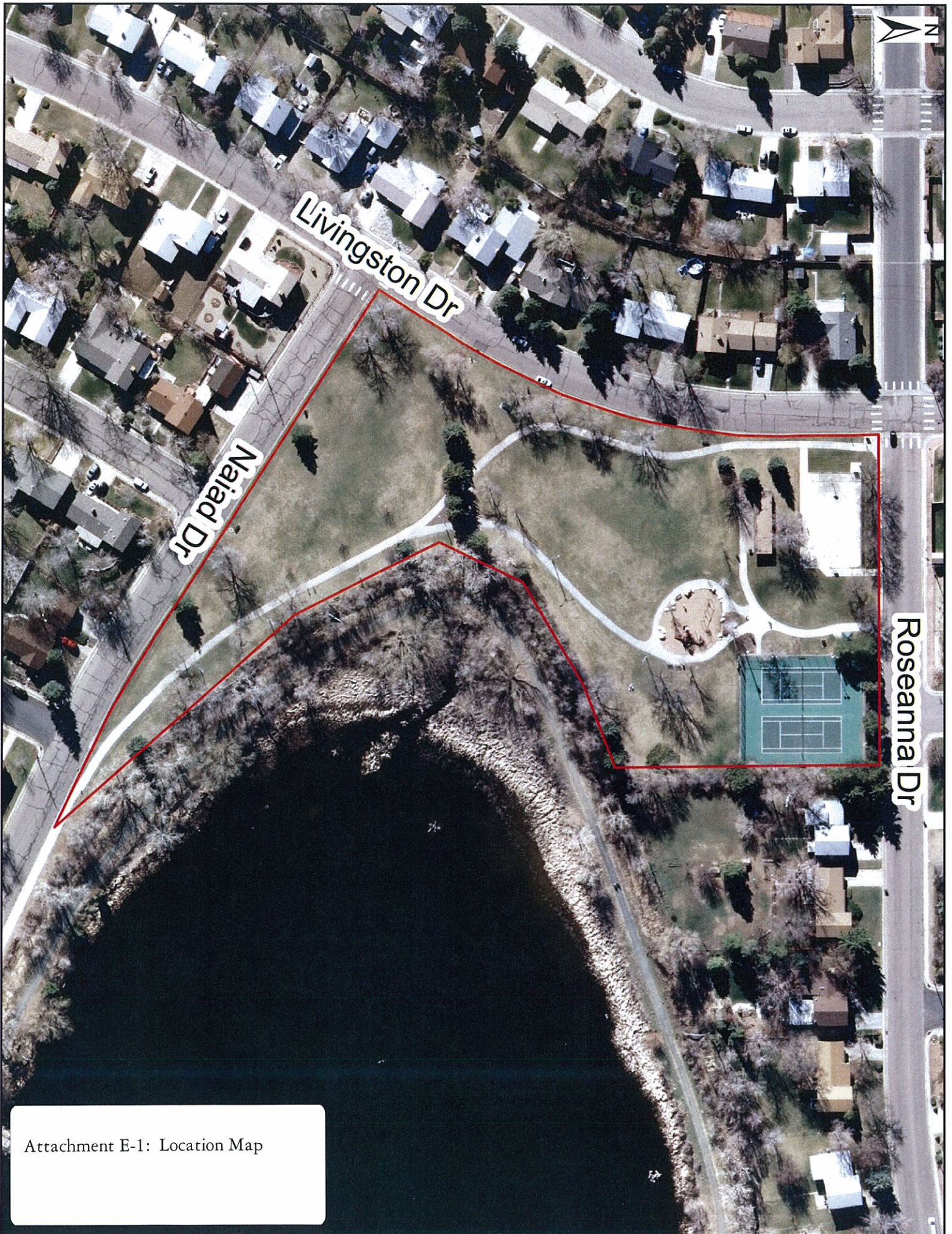
Attachment E-1: Location Map