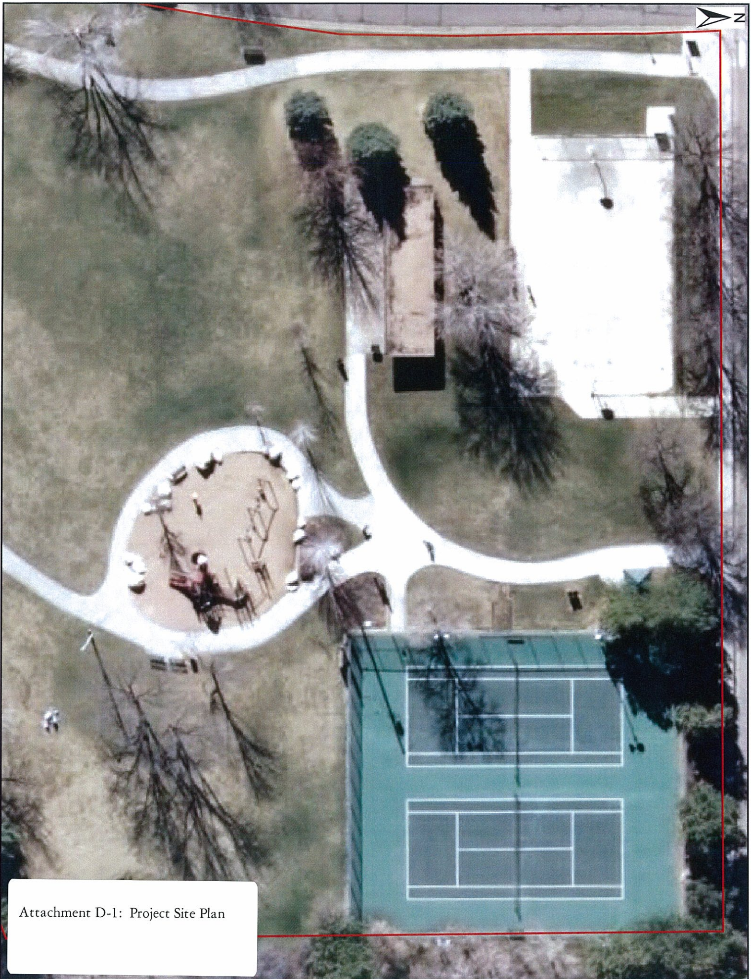
Attachment D-1: Project Site Plan