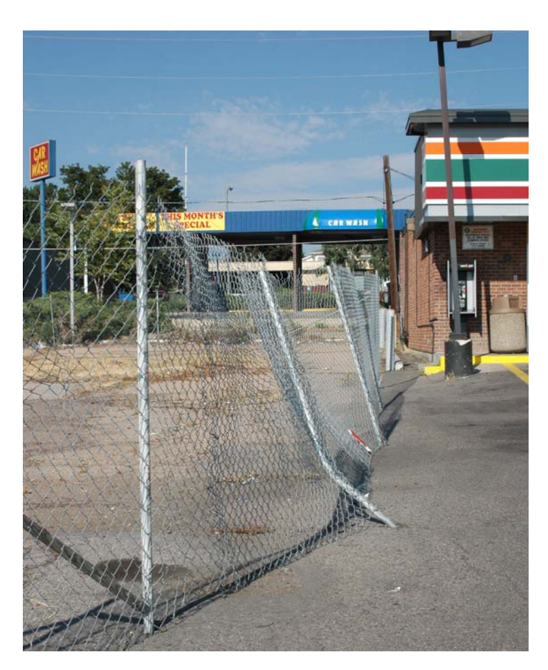
<u>5.4.4</u>. Result of fence obstructing driveway.