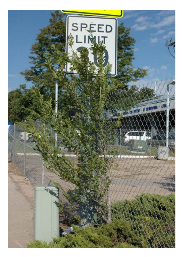
<u>5.4.6</u>. Tree obstructing traffic sign.