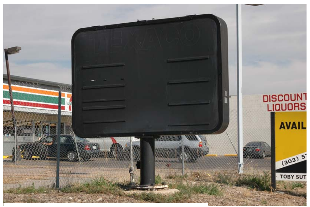
5.5.3. Abandoned sign.