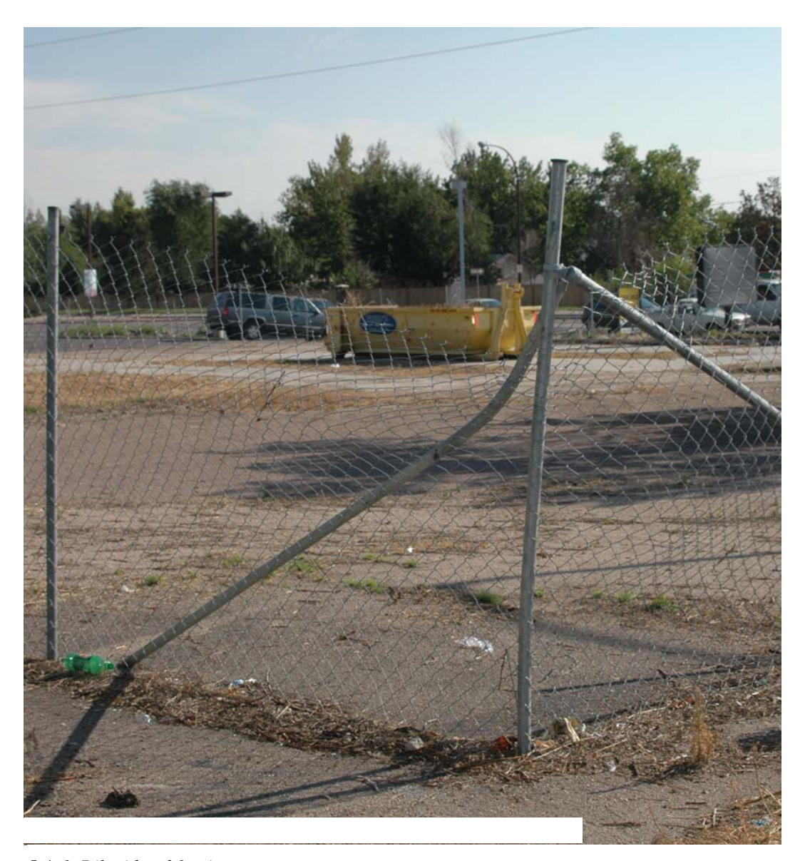
5.4. 1 Dilapidated fencing.