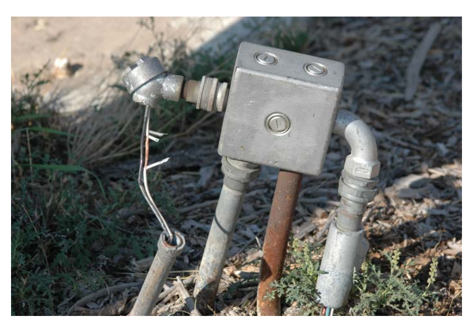
5.4.8. Exposed electrical wiring.