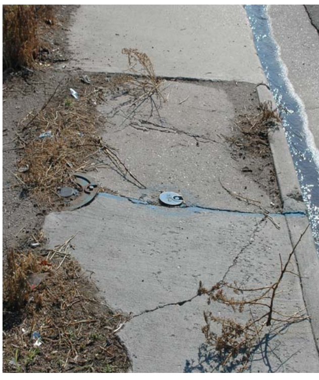
<u>5.6.2</u>. Water meter located in sidewalk.