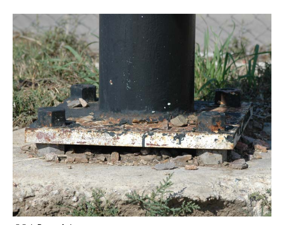
5.5.4. Base of sign.