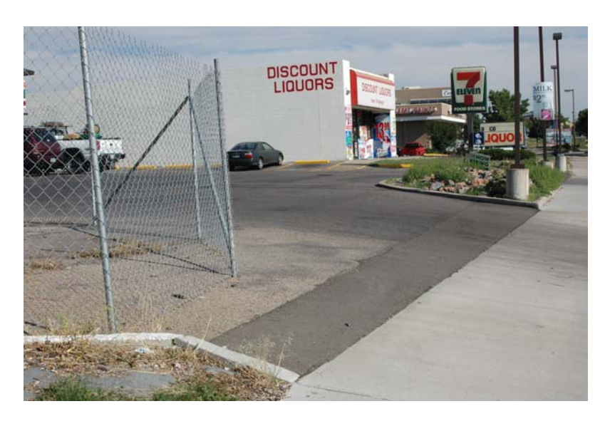
5.4.3. Fence obstructing shared driveway.