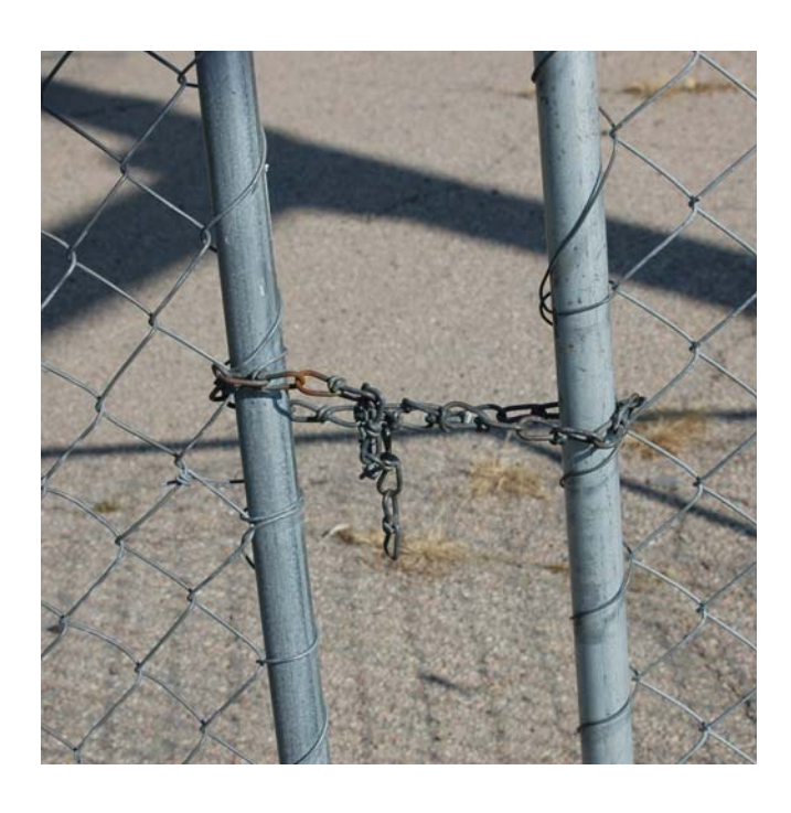
<u>5.8.2</u>. Site unsecured. No lock on gate.