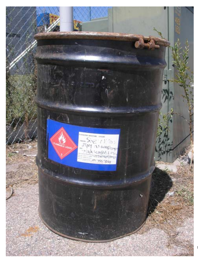
<u>5.8.1</u>. Abandoned hazardous materials barrel.