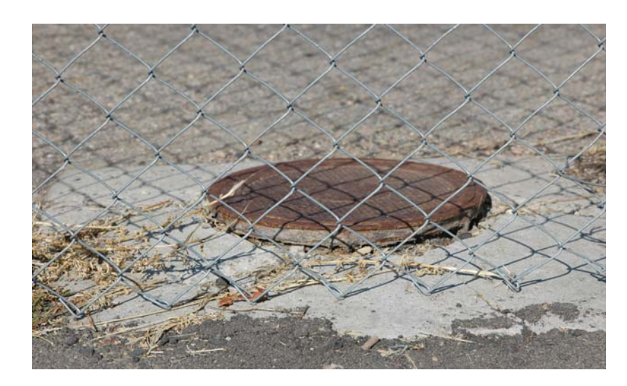
5.5.1. Broken concrete.