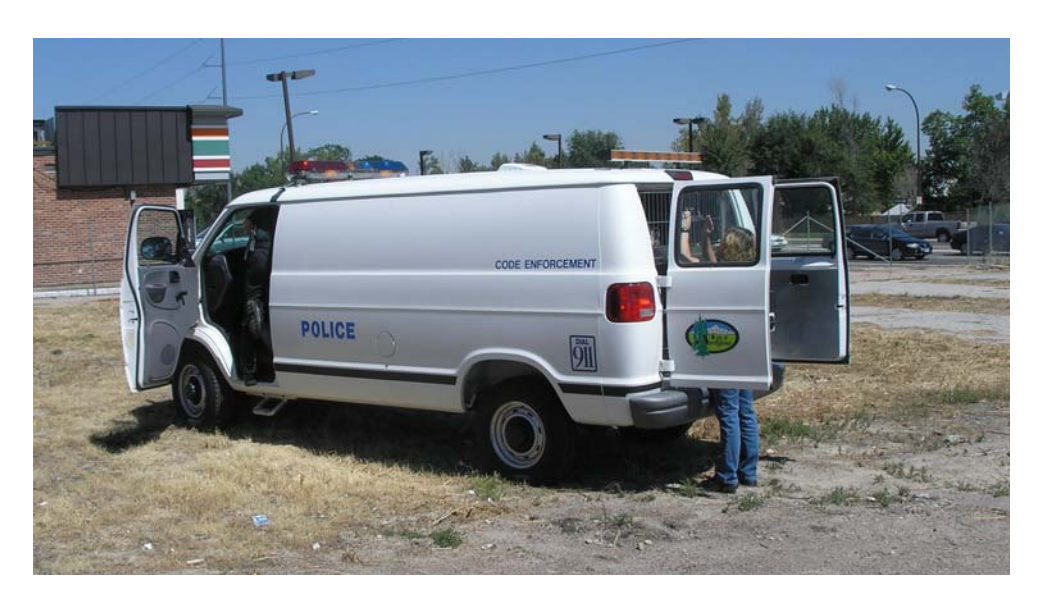
5.11.1. Code enforcement trapping vermin on site.

The principal structures on the site were demolished in December 2003, leaving a variety of appurtenant fixtures and remnants. The gasoline tanks were removed in September 2003.