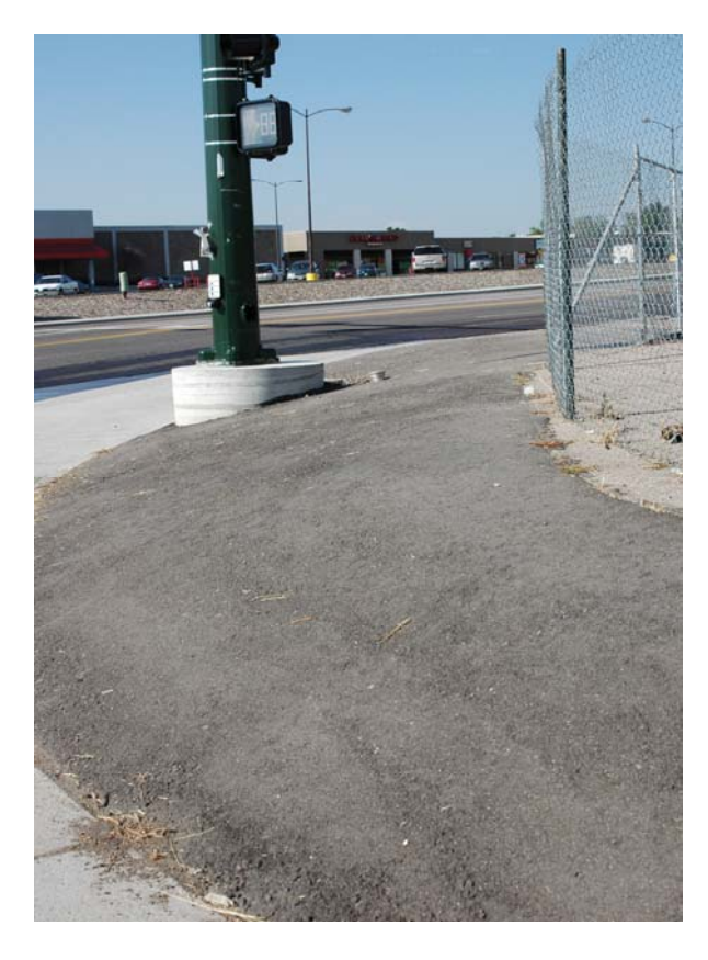
<u>5.6.1</u>. Excessive slope adjacent to public street.