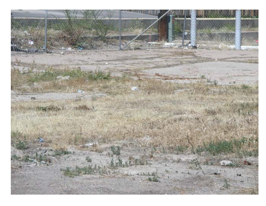
5.5.2. General site deterioration.