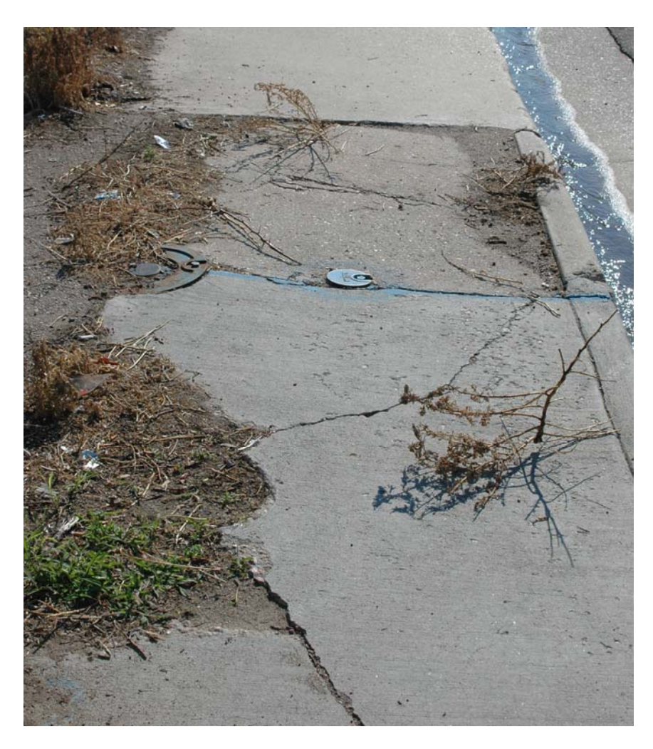
5.4.1. Broken sidewalk adjacent to site.

Unsanitary or unsafe conditions depicted below include trash, refuse and other debris improperly stored, illegally dumped or in such condition as to attract and harbor vermin; broken or inadequate public or private improvements which pose a threat of harm or injury; conditions which pose a threat to public health by spread of disease; and miscellaneous hazards and conditions.