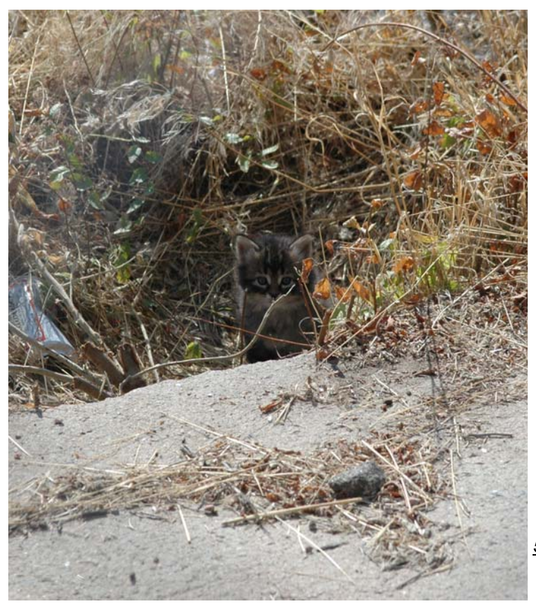
5.4.5. Broken concrete drive and cavities underneath Sheltering stray and feral animals.