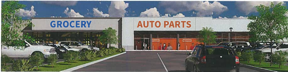
Huron Center rendering of new redevelopment project of the 57,442 square foot former Albertson's & Rite Aid building.

On April 3, 2017, the Northglenn Urban Renewal Authority (NURA) approved agreements with Evergreen-104 th & Huron, LLC and Impala Capital, LLC, to redevelop the 10.45-acre, 104,322-square-foot Huron Center.