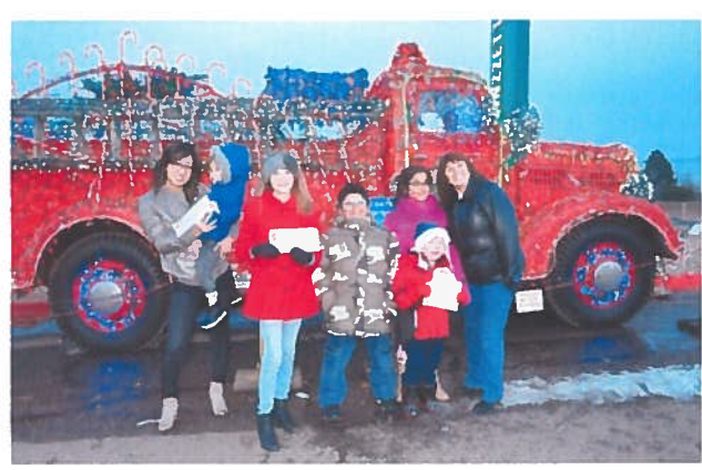
2016 Winners of the 10th Annual Count the Lights Contest.

A special thanks to the Northglenn Urban Renewal Authority (NURA), which donated $2,000 in prize money, the Northglenn Historic Preservation Foundation for loaning the firetruck, and Dodge Signs for producing the signage for the event. Also, Cinzzetti's, Caliber Collision, Gunther Toody's and