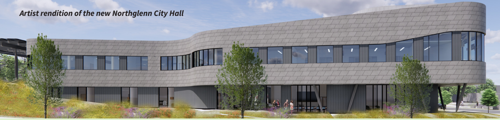
Artist rendition of the new Northglenn City Hall