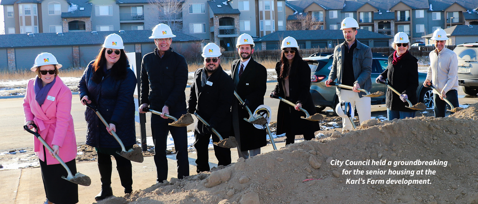
City Council held a groundbreaking for the senior housing at the Karl's Farm development.