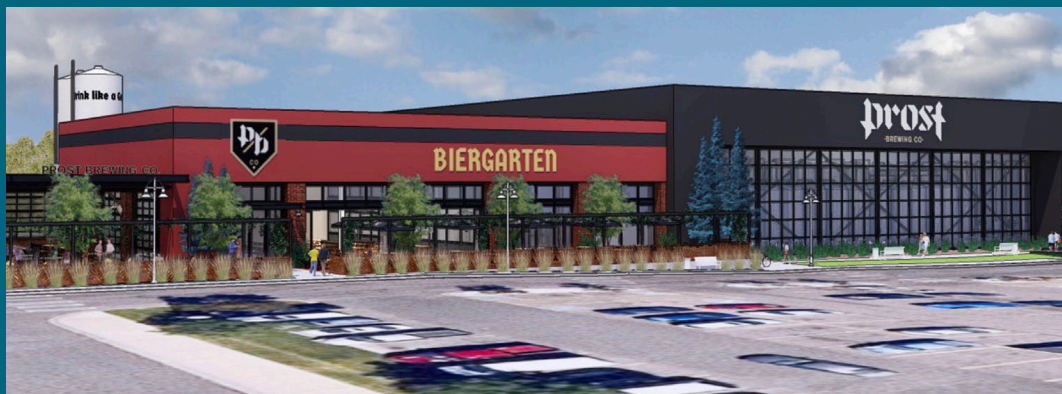
Artist rendition of the new Prost Brewery and Biergarten

The brewery will receive national recognition as one of the most sustainable and technologically advanced in the country. They plan to produce 20,000 barrels initially and grow to 40,000 to 50,000 over the next