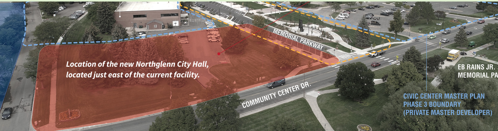
Location of the new Northglenn City Hall, located just east of the current facility.