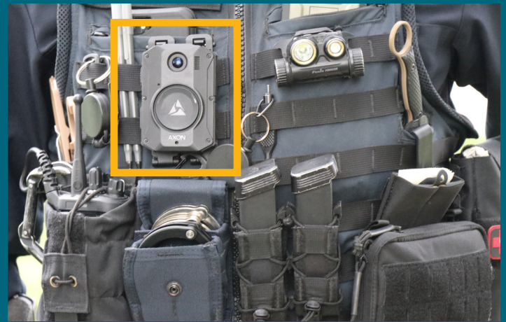
Body-worn cameras are now worn by all officers.