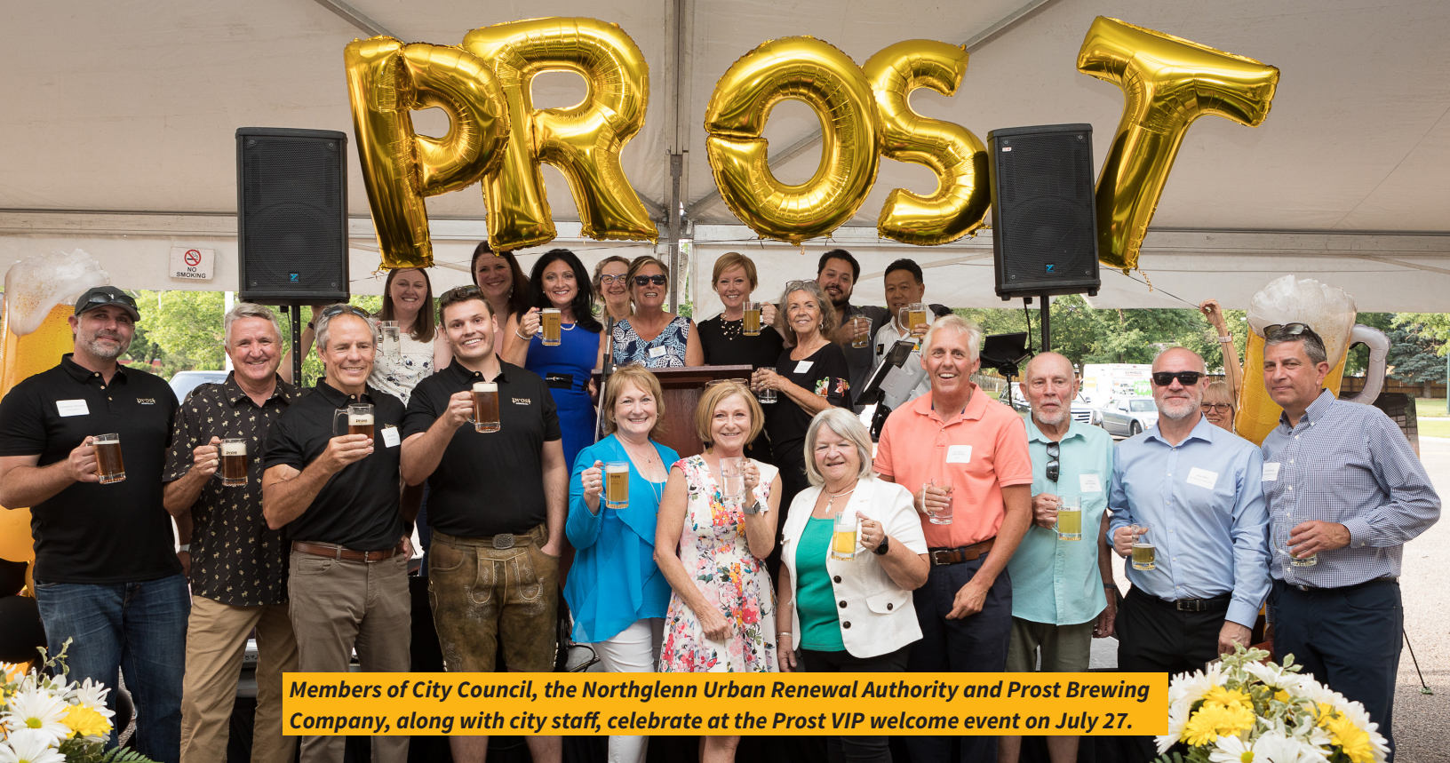
Members of City Council, the Northglenn Urban Renewal Authority and Prost Brewing Company, along with city staff, celebrate at the Prost VIP welcome event on July 27.