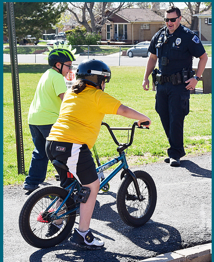
The Northglenn Police Department hosts outreach activities including bike safety rodeos at local schools, the Citizen's Police Academy and Safe Street Halloween.