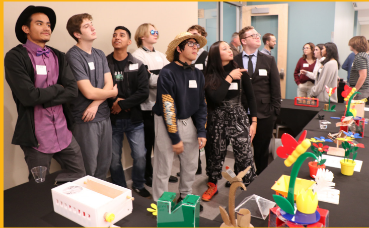
Northglenn High School STEM students create centerpieces for the City's Business Appreciation Event every year.

The most effective programs are those partnerships among our educational institutions, local stakeholders and local governments. Due to its importance to our communities, the City supports education as a