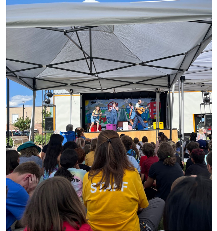
Butterfly Effect Theatre Company