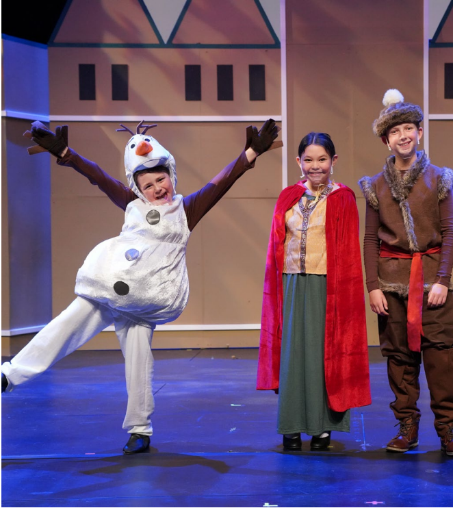
Northglenn Youth Theatre, NYT Jr. & Academy