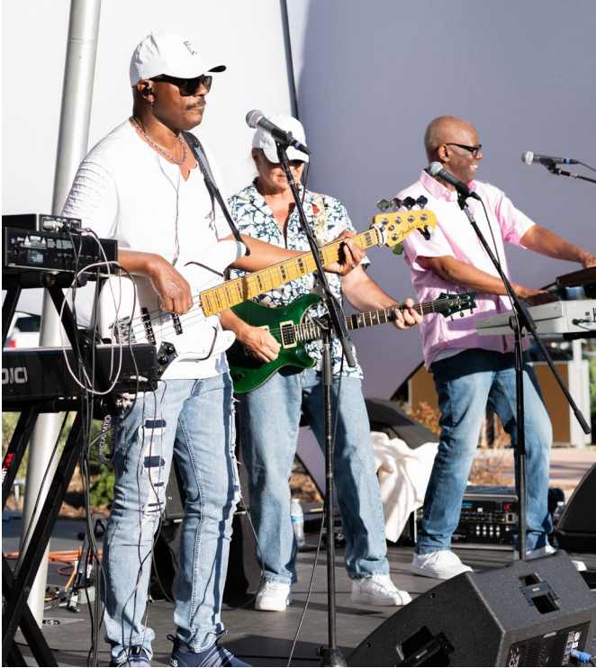
Summer Concerts & Movies