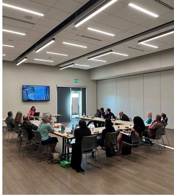
City Hall Lobby Project