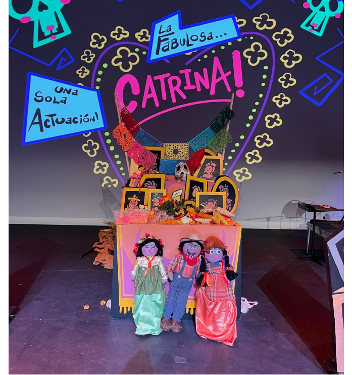
Northglenn Arts Presents