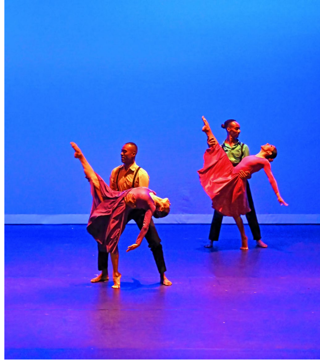
Northglenn Arts Presents