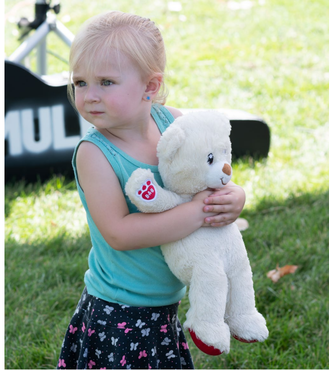
Teddy Bear Picnic