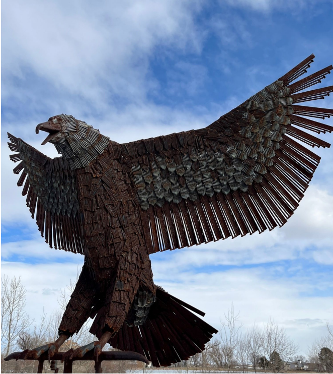
Art on Parade Winner