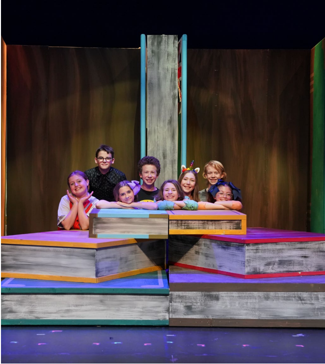
Northglenn Youth Theatre, NYT Jr. & Academy