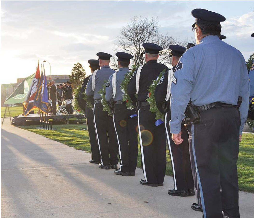
The City of Northglenn hosts a candlelight vigil every May to honor Colorado peace officers who have fallen in the line of duty.