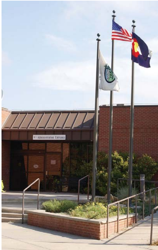
Northglenn City Hall