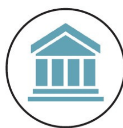
Community Education and Civic Engagement