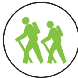
Open Space and Land Use