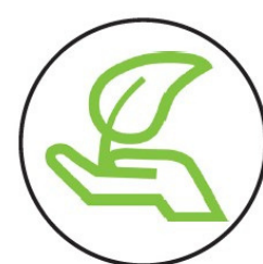
Environment and Public Health