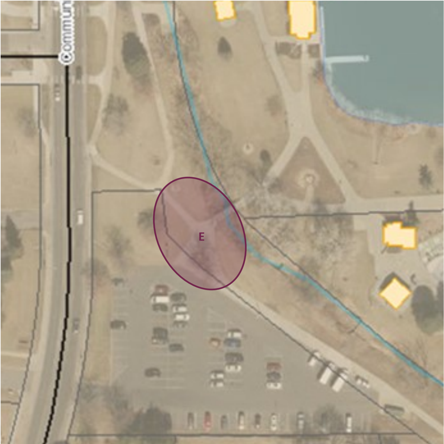
E Park entry, west of bridge (as proposed by the Parks & Recreation Advisory Board)