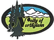
EXHIBIT A PROPOSAL REQUIREMENTS AND SCOPE OF SERVICES