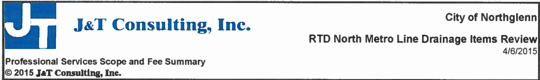
Exhibit A - Additional Scope of Services