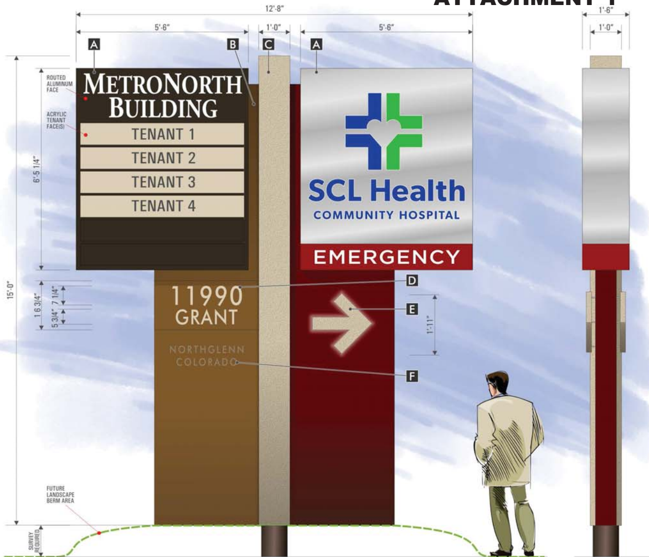
4 DOUBLE FACE INTERNALLY ILLUMINATED FREESTANDING SIGN QUANTITY: 1 MANUFACTURE & INSTALL