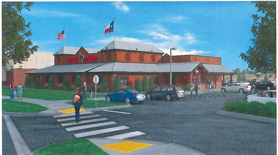
Texas Roadhouse rendering of 7,500-square-foot restaurant to be constructed in the Northglenn Marketplace.

A new building will be constructed on the site of the former Bennigan's Grill and Tavern, located inside the Northglenn Marketplace at 231 W. 104 th Ave. Construction of the 7,900-square-foot restaurant facility is expected to begin this summer, with an opening date in early 2016.