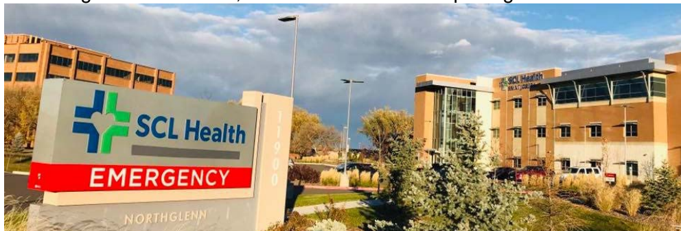
Business After-Hours and celebration of re-opening of emergency facility and partnership with Kaiser Permanente.

Business After Hours - On Nov. 1 a Northglenn Business After-Hours event was held at SCL Health Saint Joseph Emergency facility at 11900 Grant Street. The event provided networking opportunities with Northglenn businesses, and celebrated the re-opening of SCL Health Saint Joseph Emergency