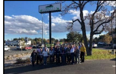
Igadi, Ltd. ribbon cutting on Oct. 18 of a 3,150 s/f marijuana dispensary at 11919 Washington Street.