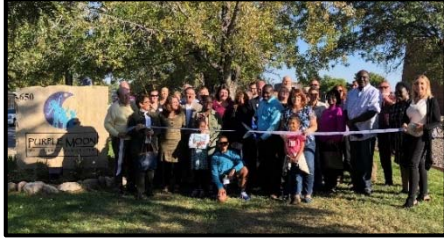
Purple Moon ribbon cutting on Sep. 25 on a 3,197 s/f childcare center at 650 Kennedy Drive.

A complete list of 2018 ribbon cuttings can be found at www.northglenn.org/biz/ribbon_cuttings . Below are recent ribbon cuttings: