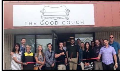
The Good Couch North ribbon cutting on Aug. 21 of a new 6,000 s/f facility at 425 W. 115 th Ave.