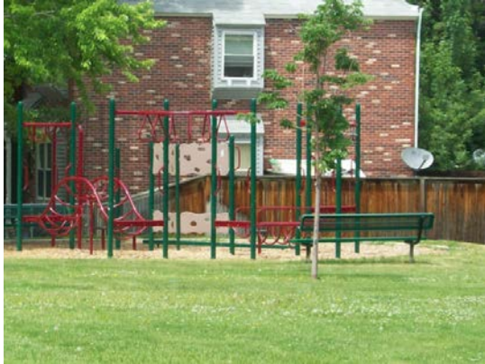
Figure 5: Playground at Village Greens II

116th and Pennsylvania. There are picnic tables, flower beds, large grassy areas and children's playgrounds at each of the two parks. The playground equipment is scheduled for replacement in 2017.