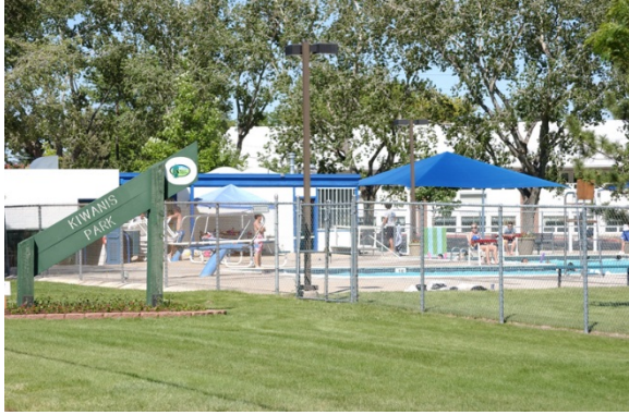
Figure 7: Kiwanis Park