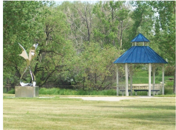
Figure 1: Winburn Park Gazebo and Ascension sculpture

This park is located on Huron, just south of 112th Avenue. This area is the home of the Winburn Ponds, a small gazebo and a large turf field. The park is primarily a space for passive recreation, though a recent proposal to develop a disc golf course on the property is under consideration.