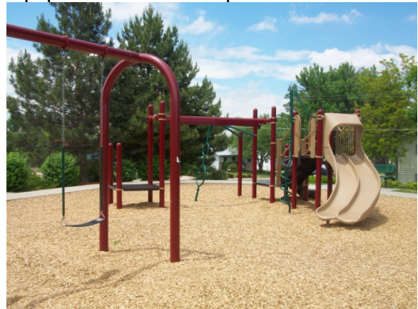
Figure 2: Playground at Huron Crossing

This small neighborhood playground and park consists of just under 2 acres of turf and a children’s playground. There is also a basketball court, a small gazebo with a picnic table, a grill and a water fountain. The playground equipment was last replaced in 2009.